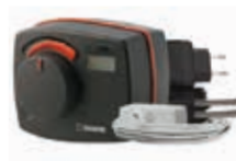
CRC141 230 V AC

Thanks to the special interface between the controller series CRC140 and the ESBE series VRG, VRH and VRB, the unit as a whole has a unique stability and precision when regulating. The controller series CRC140 is also easily mounted in ESBE valves MG, G, F and BIV.