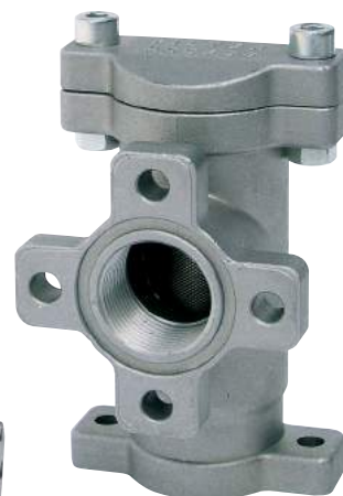
LINE FILTER 1-1