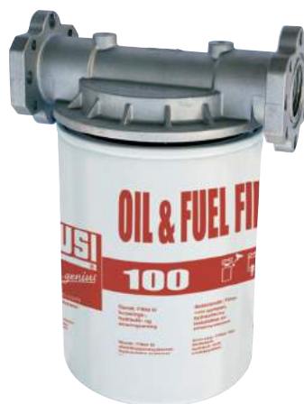
OIL AND FUEL FILTER